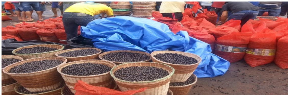
Figure 4: Pedra de Santa Inês Fair—Traditional Amazon baskets ( paneiros ) and 30kg sacks in the background.