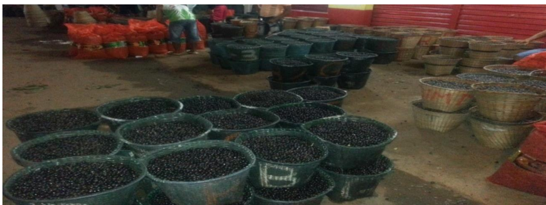
Figure 3: Port area of Santana where the açáí is sold.

The intermediary is always the same person, Lindoval Santana. This sale between the two parties has been taking place for ten years; the middleman defines the price that the intermediary will pay.