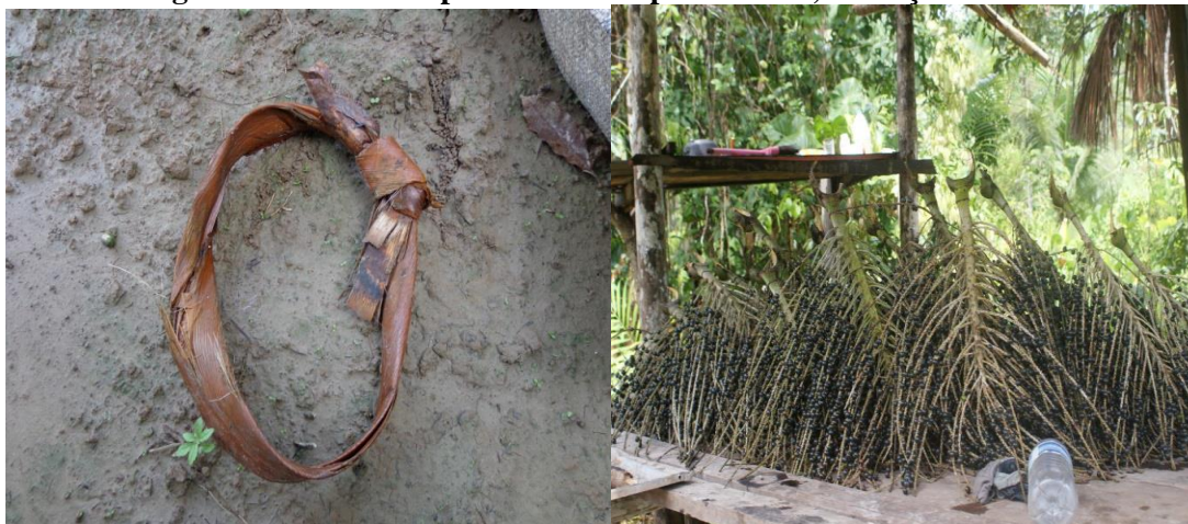
Figure 2— Peconha loop made from a palm leaflet; Cut açai bunches