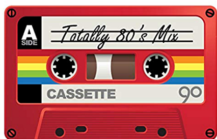
Figure 1. Recording Cassette.

Let me explain this with an example that anyone who was born in the 1970s can relate to.