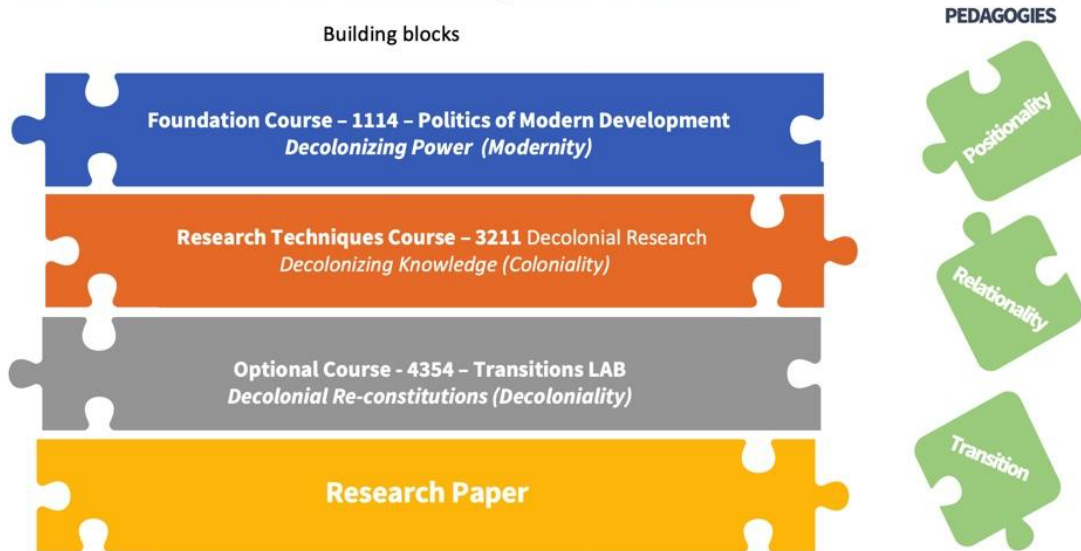
Figure 3. Modernity/Coloniality/Decoloniality

The course adopts a global perspective on contemporary political philosophy. This means that ideas and questions of European and American political thought are placed in a dialogue with authors and thinkers positioned in an epistemic or cognitive 'South' in order to stimulate a decolonial/decolonizing epistemology in the classroom.