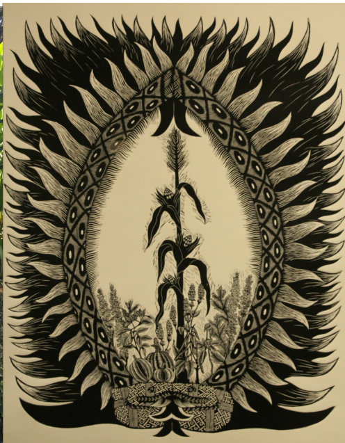
Figure 5. Cuando las semillas de la dignidad Florecen

I am sharing with you two images now. On the left (Figure 4), a Milpa from Oaxaca, Mexico, which is a mix of squash, beans and corn; and next to her, the engraving “ Cuando las semillas de la dignidad florecen ” from the collective autonomous workshop Grieta Negra Taller.