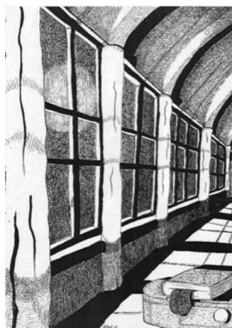
Corridor, ink, 2002

https://www.iss.nl/en/news/broken-links-covid-19-online-art-exposition bergeijk@iss.nl