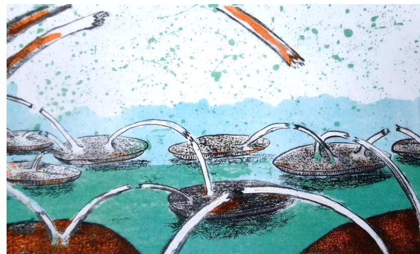
Broken links, lithography 2020