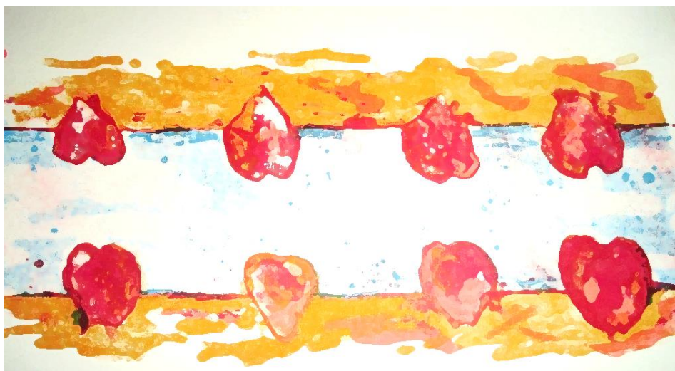
Hard, heard, hurt, lithography, 2017