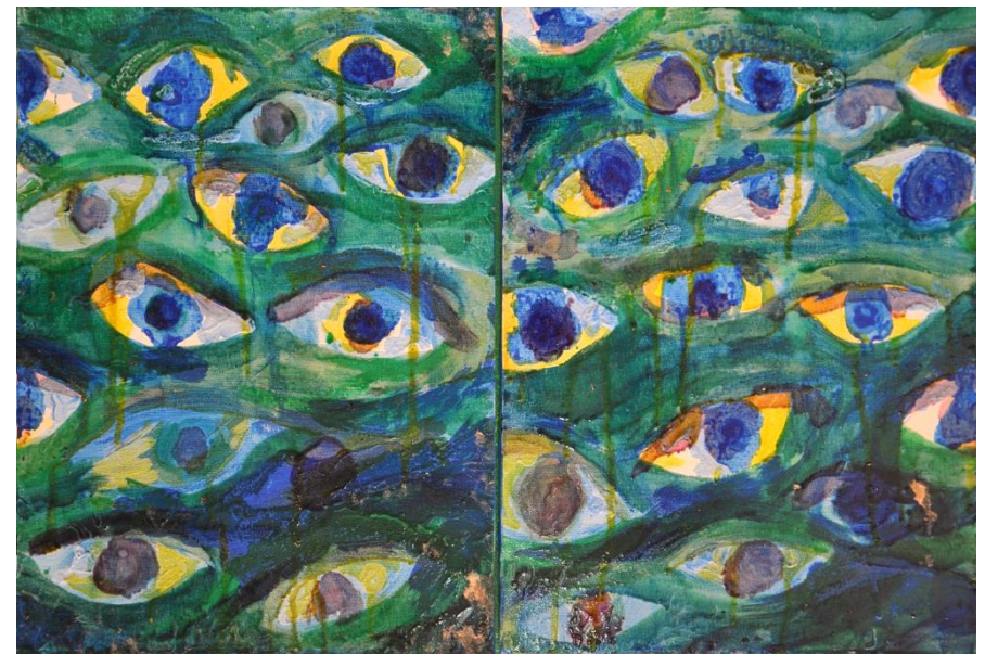
I sea, diptych, oil on canvas 2012

created links is also reflected in new titles for existing works of art and honors the dynamism and entrepreneurship during the first wave of the pandemic that led in a Schumpeterian sense to new ways to combine products, technology and delivery in academic teaching and research. Indeed, you will find the four-panel Neue Kombinationen on the first floor and you can alter the sequence of the paintings yourself!