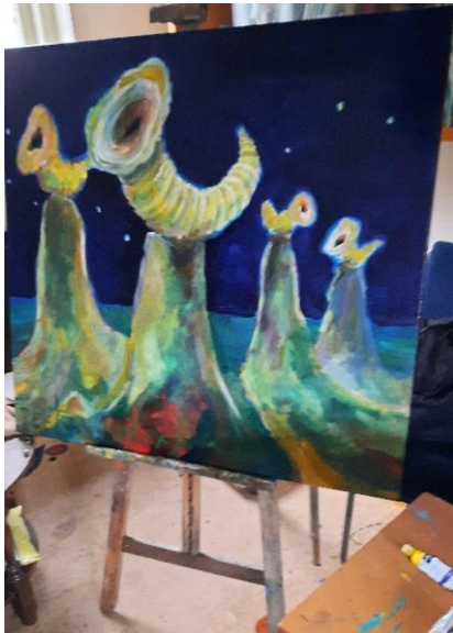
Horns of plenty, oil, 2020

Our broken links are echoed by an installation in the righthand main staircase. You will see a hanging metal chain that connects beginning and end of the exhibition. The chain holds, even though it is broken. Also, the lithography on the front of this catalogue is inspired by the connections that we seem to have lost during 2020.