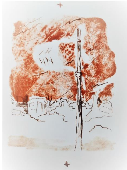
Mouth caps forever, litho, 2020

But these links can be restored, and the exhibition has many examples of unexpected, resilient connections. The clearest example of such a link is the ink drawing that features on the book cover of Pandemic Economics , to be published in 2021. That drawing was first used for the cover of the MA thesis Economie van de oorlog (Economics of war; in Dutch at Erasmus University Rotterdam in 1985). This pattern of newly