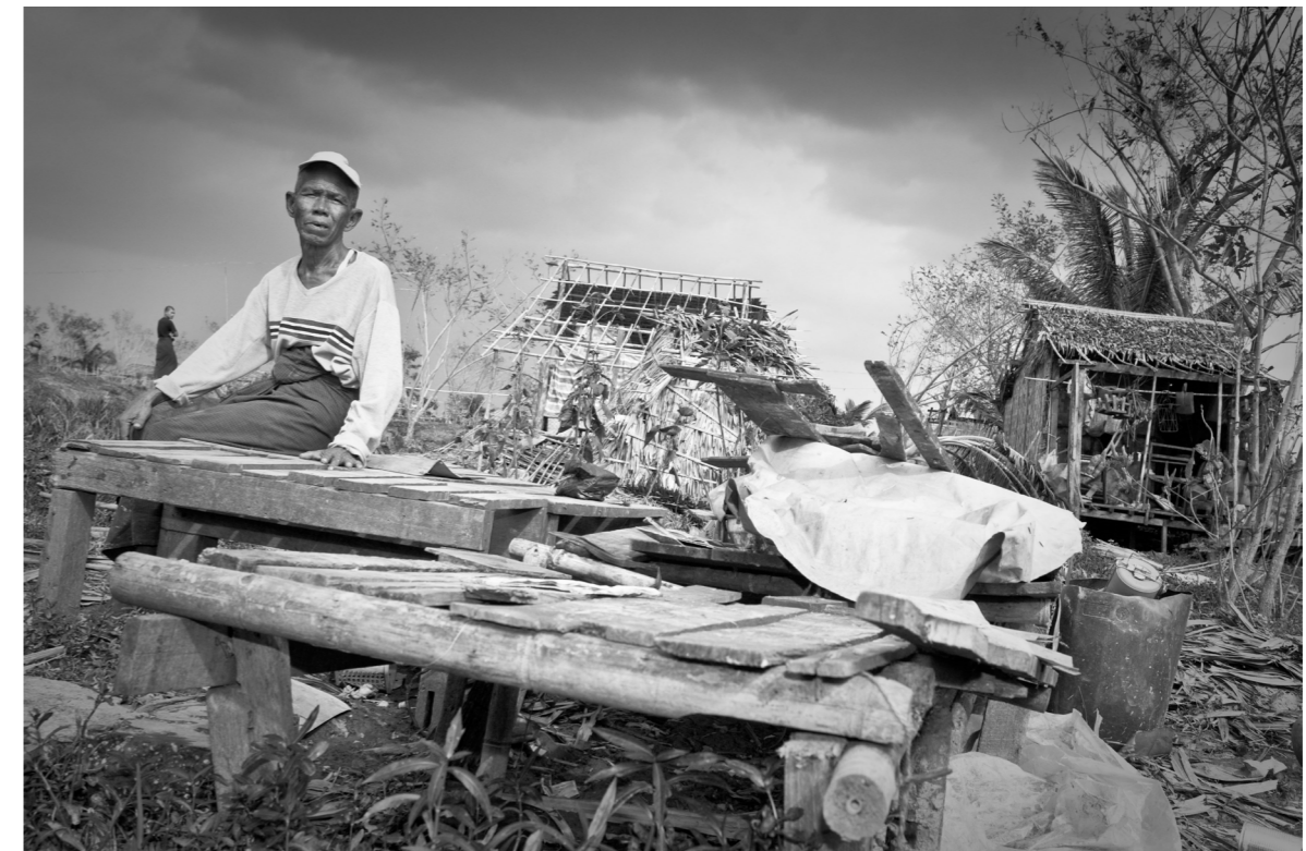
The effects van cyclone Komen.

violence between Buddhist and Muslim communities killed hundreds and displaced 140,000 in 2012. The fate of the Rohingya Muslim minority, portrayed in the mainstream Myanmar discourse as illegal immigrants, was far from resolved in 2015. Chin State is inhabited by members of the historically marginalised ethnic Chin minorities, which are predominantly Christian. 5 The degree to which they face persecution and still need international protection is debated. The UN High Commission for Refugees, 6 however, confirmed the maintenance of their refugee status in March 2019.